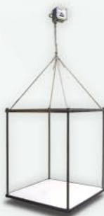
Platform is not in the litter